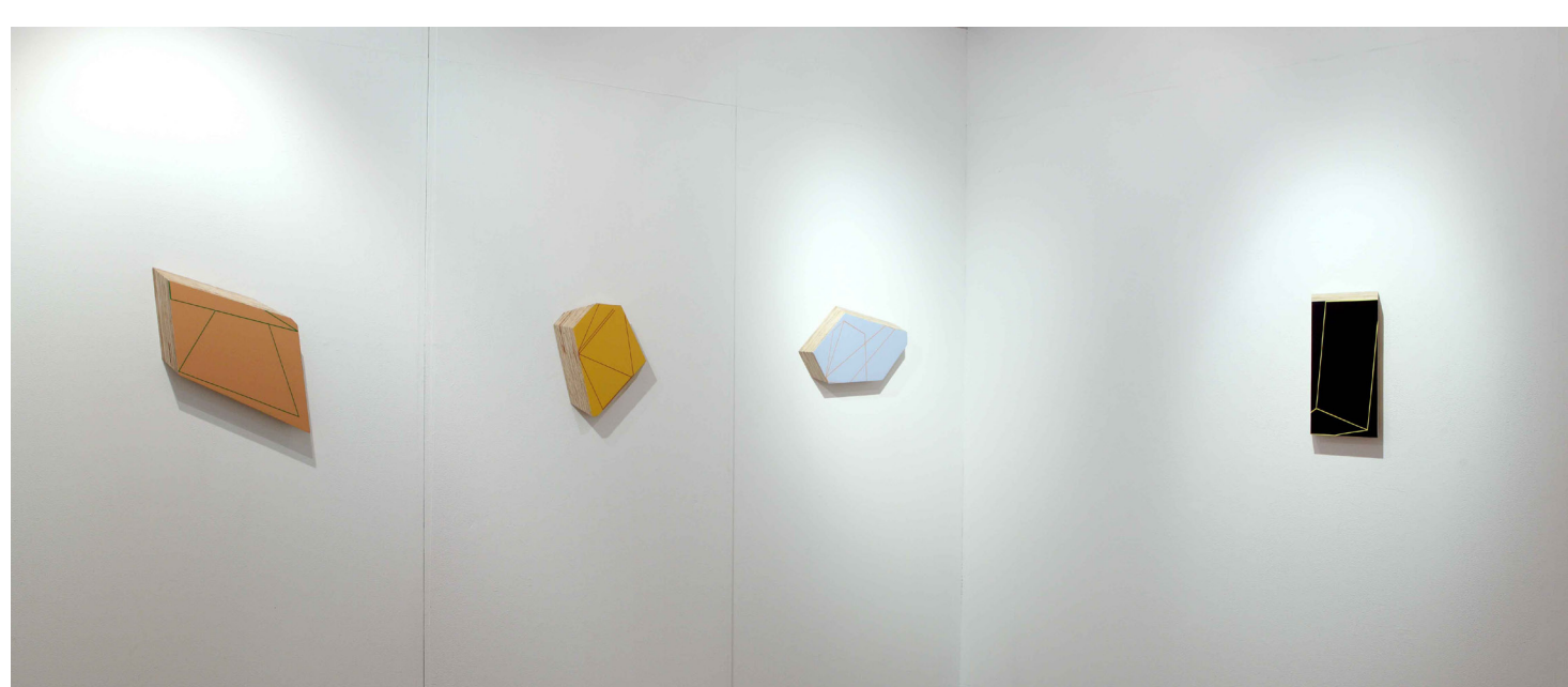
Gareth Jenkins - Installation view, 2013 (courtesy of the artist, photographed by Fiona Morrison).

The grounds of Gareth's paintings are carefully treated. His current work is cut from plywood, meticulously prepared and sanded so that the application of paint is smooth and effortless, which emphasises the hard-edged linear concept of each particular painting. Repetition, simplicity and a reduced, almost minimal palette abound. Gareth's natural progression for the idea of these paintings-as-handcrafted objects is demonstrated by his move to the three-dimensional.